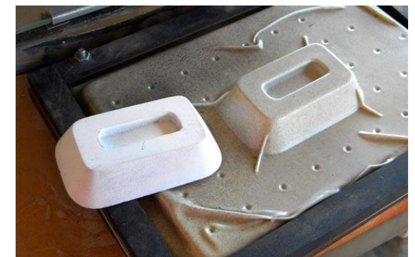
Thermoplastic and a Thermosetting Plastic